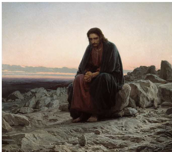
Christ in the Desert, Ivan Kramskoi (1872)

We are invited to walk with Christ into the quiet places, trusting that God meets us even, and perhaps especially, in the emptiness. The desert may be dry, but it is fertile ground for grace. And if we allow the journey to shape us, we will emerge from it changed, strengthened, and ready to follow Christ with renewed hearts as we move toward the joy of Easter.