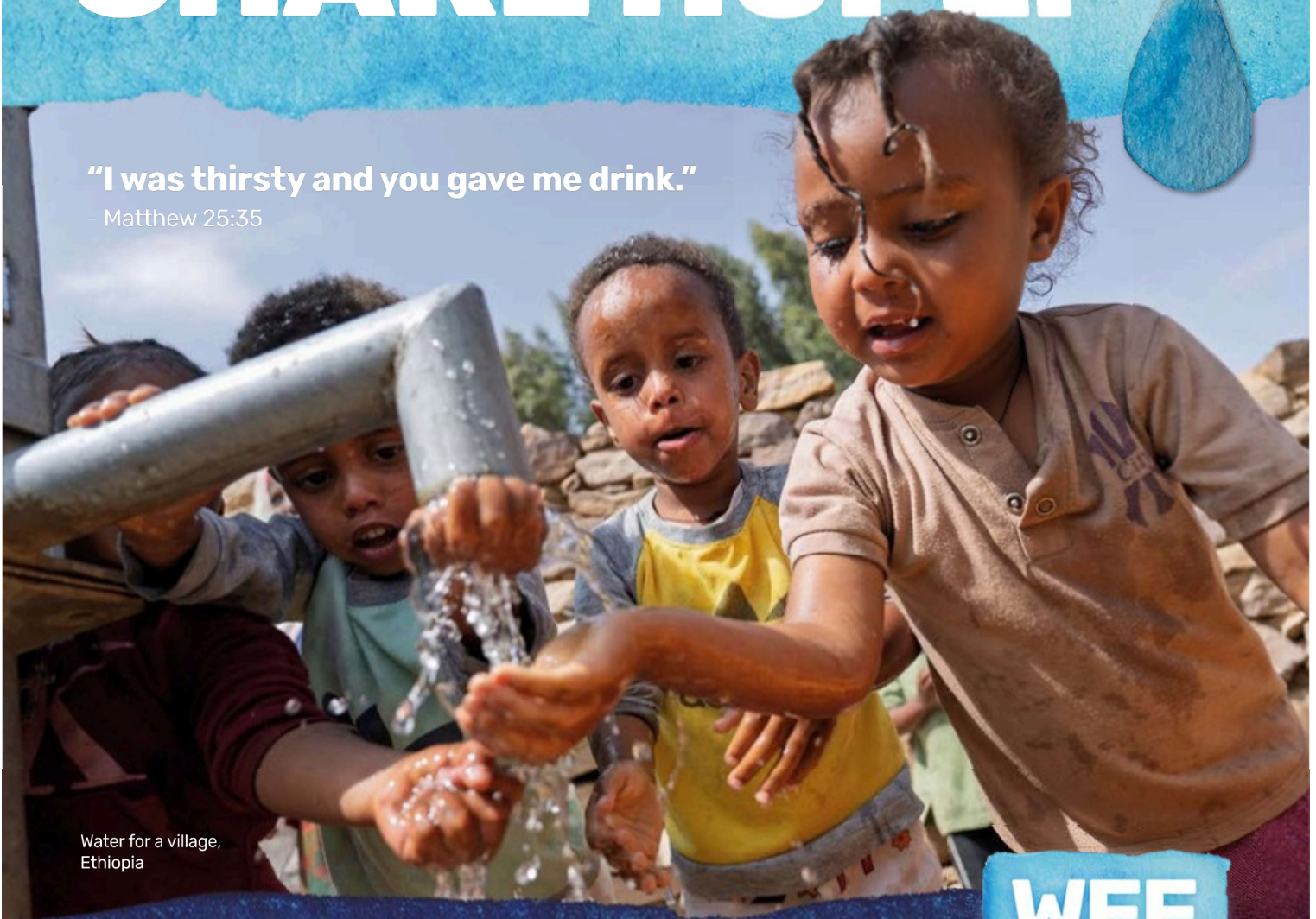
Water for a village, Ethiopia

This Lent, use your WEE BOX to make a BIG CHANGE!