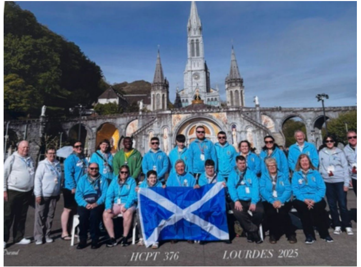
HCPT 376 Group Photo 2025

The group fundraises continuously throughout the year with car boot sales, coffee mornings, bingo, race night, Christmas Concert and New Years day dip.