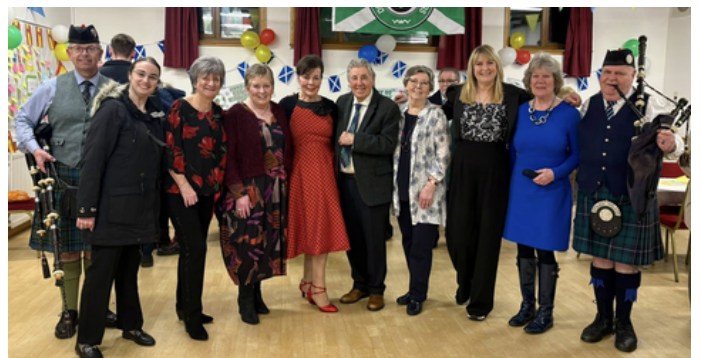
Celebrations continuing in Prestwick