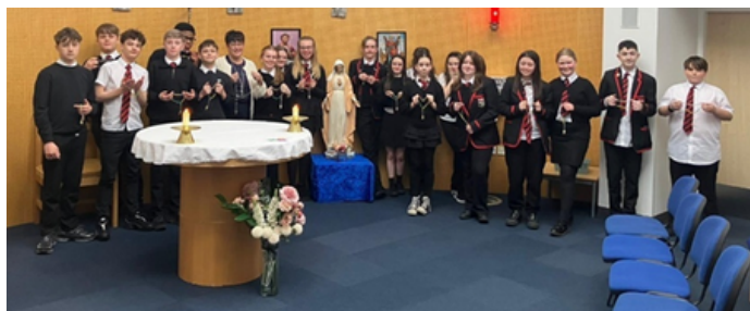
S1-S3 Rosary Group