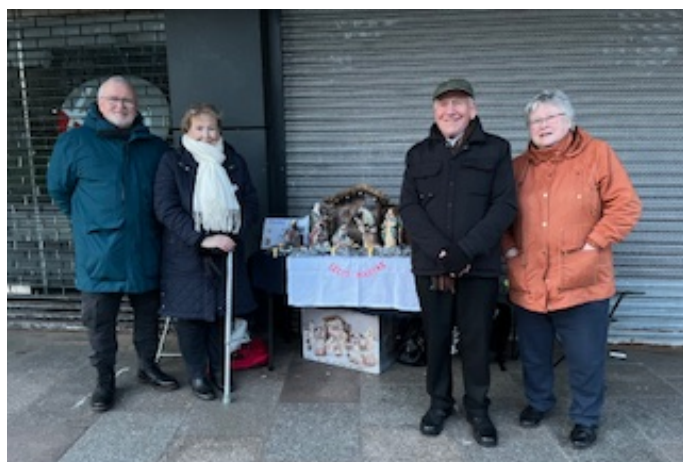
The Praesidium at the Mall in Irvine at Christmas.